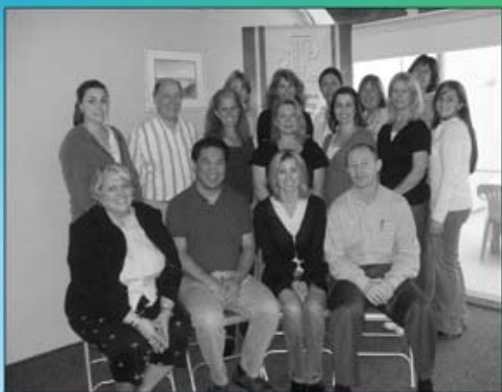
Class from San Diego Mastership Course in 2007